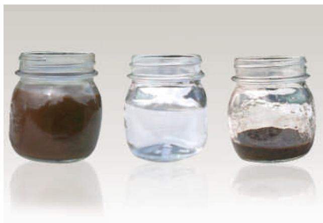
Black water (100%) before treatment with BlueVap Clear water (80%) after treatment Concentrate (20%) after treatment